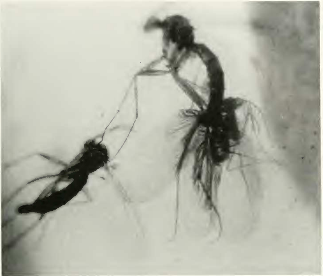
Fig. 1. Photomicrograph of male holotype of Cascadilar eocenicus .